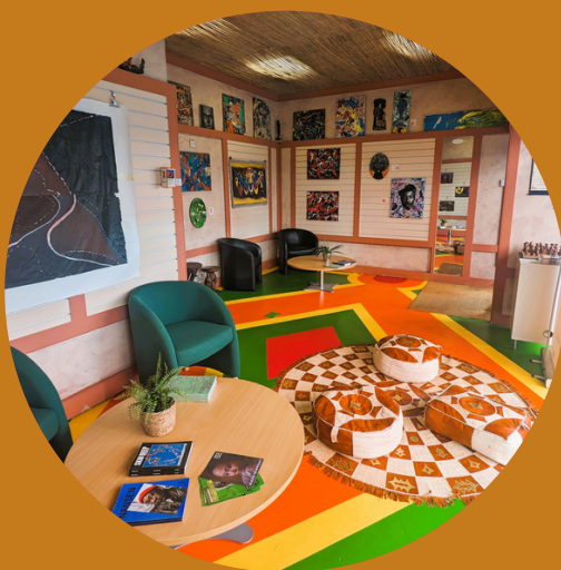
Creative Hub space hire