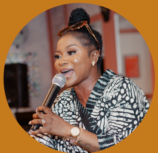
Creative and cultural events