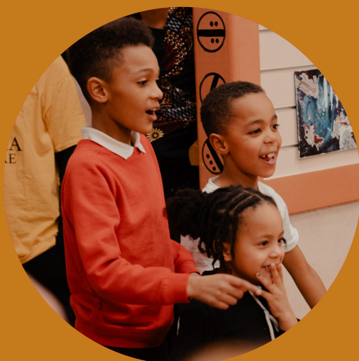
Youth Academy (Ages 6-16)