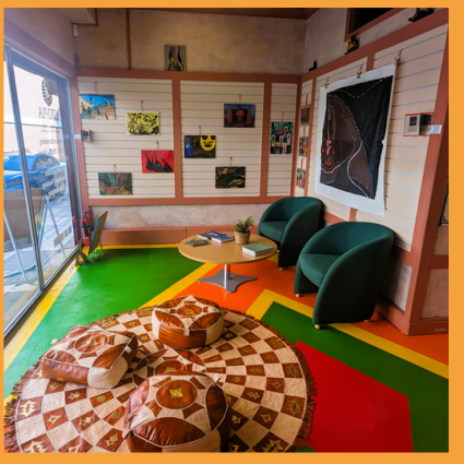
A large flexible space